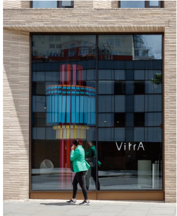
The Floating Column by Space A at VitraA Bathrooms © Luke O'Donovan