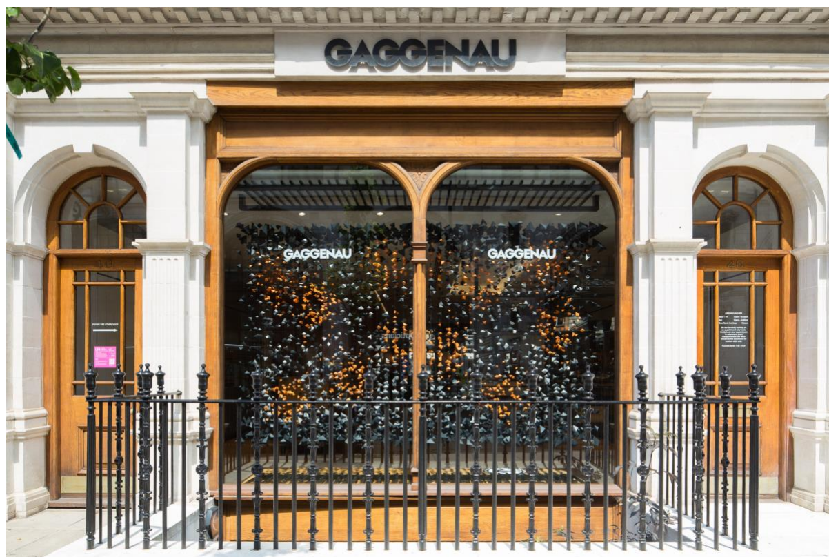
Fragment by Inclume at Gaggenau