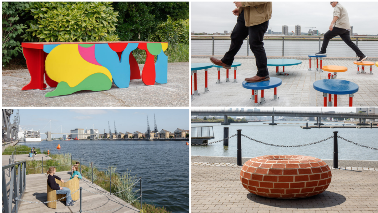
Winning benches from 2023